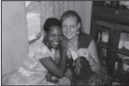
"One of my favorite parts of the time I spend in Uganda working on product development is visiting the homes of our artisans."